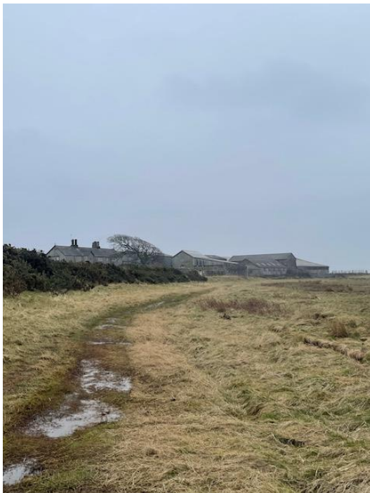
Approach to Cannon Winder Farm

There is a large wind turbine in the fields to your left, after that you will see that the path heads towards some farm buildings in the distance. Continue along the same line, i.e. fence/wall line to your left and open bay to your right, and eventually you will pass directly to the right of this farm (Cannon Winder Farm) with its impressive chimneys.