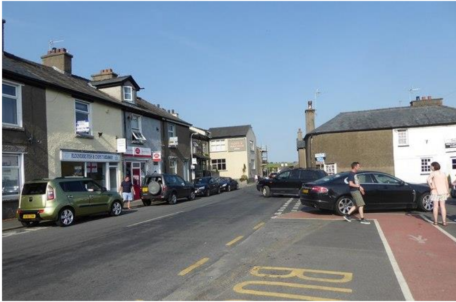
Flookburgh Village Centre

7. Eventually, the road rises up and enters the village of Flookburgh.