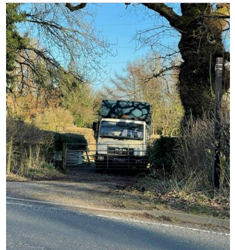
The not too obvious entrance to the green lane from Burton Road

A short distance later, Burton Road bends round to the left, at this point look across the road to your right and you will see a gap in the hedge with a gate, there is usually a wagon parked up behind the gate. This is the start of the green lane section of the walk.