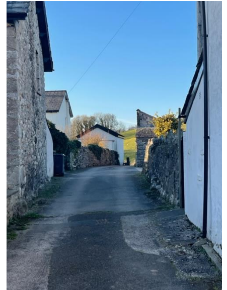
The lane to the left of Rosethorn Cottage

6. Returning to our walk, just after passing the farm buildings with the clock tower, lookout for Rosethorn Cottage on your right. Turn right down the track on the lefthand side of the cottage. The track is followed a short distance between farm building and houses before turning left and dropping down to a bridge over the canal (bridge number 137). Cross over the bridge and then drop down right to regain the canal towpath. Turn left (ie away from the bridge and follow the canal until you reach the next bridge. You are now back at bridge number 138).