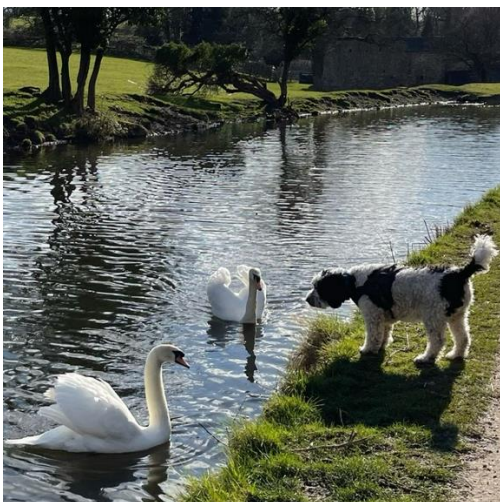
Dusty meeting his new friends

5. At the end of the lane, continue along the path on the left that drops down through the fields back towards the canal edge (still in the general direction of Carnforth). Follow the canal side until you reach the track that takes you back over the first canal bridge you came to at the start of the walk. Cross the bridge and turn left back along the canal towpath that quickly returns you to the starting point.