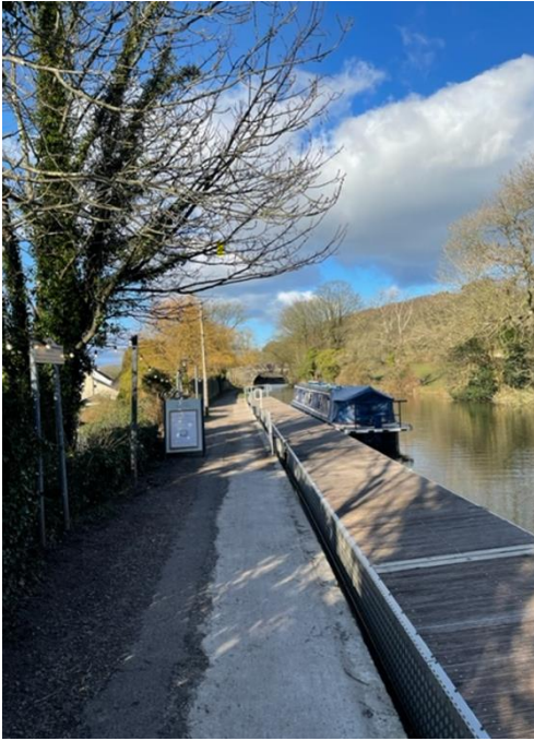
The canal by The Royal Hotel

4. At bridge number 125 leave via the path on the left which takes you up to and over the bridge. Follow the lane past the entrance to Thwaite Brow Woods on your right. This lane (Twaite Brow Lane) climbs gradually uphill. The views at the top of the lane are fantastic. You can see Warton Crag and Warton Quarry in the near distance with the expanse of Morecambe Bay leading your sight to far southern and central Lake District Fells. The houses to your right are so lucky to have this view every day.