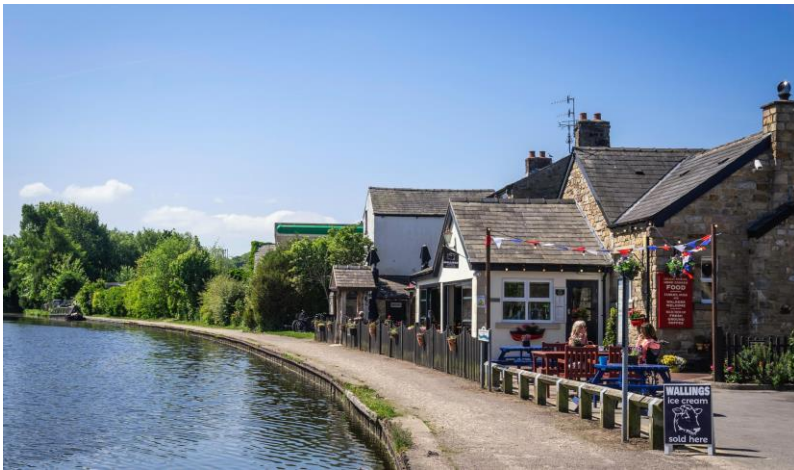
The Lancaster Canal by the Canal Turn Pub